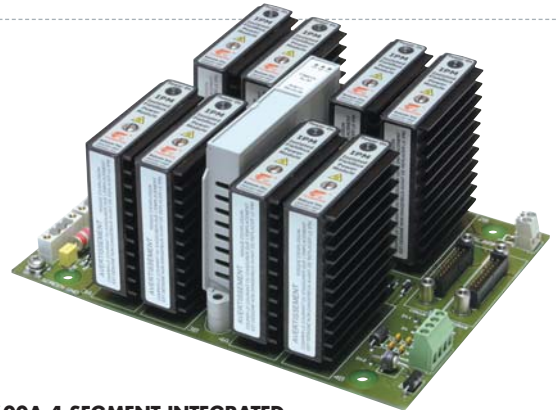
F600A 4-SEGMENT INTEGRATED REDUNDANT POWER SUPPLY SYSTEM FOR YOKOGAWA ALF-111 FIELDBUS CARD

The segment design standardised on 8 fieldbus devices per segment with a requirement for 2 spares, so the specially-developed F118-PC 10-way Megablock was selected as the wiring solution for use throughout the project. Its Zone 2 certification and 'SpurGuard' short-circuit protection allows connection to non-incendive, non-arcing and flameproof certified field devices. To simplify wiring, spring clamp connections were provided for all fieldbus connections.